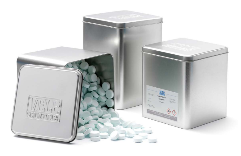
Use Genuine VELP consumables and accessories to get the best performance from your DKL